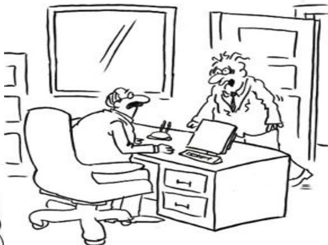
"I had a layover in Omaha ... which led to a hangover in Des Moines."