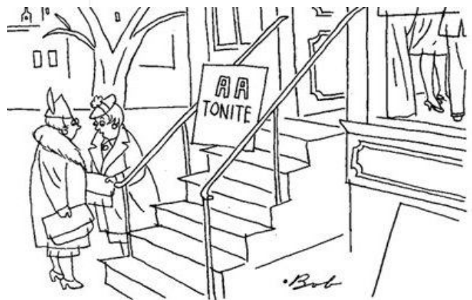
I'm packing an extra pair of underwear. The last meeting I attended here, they read some non-AA approved literature, and I shit myself.